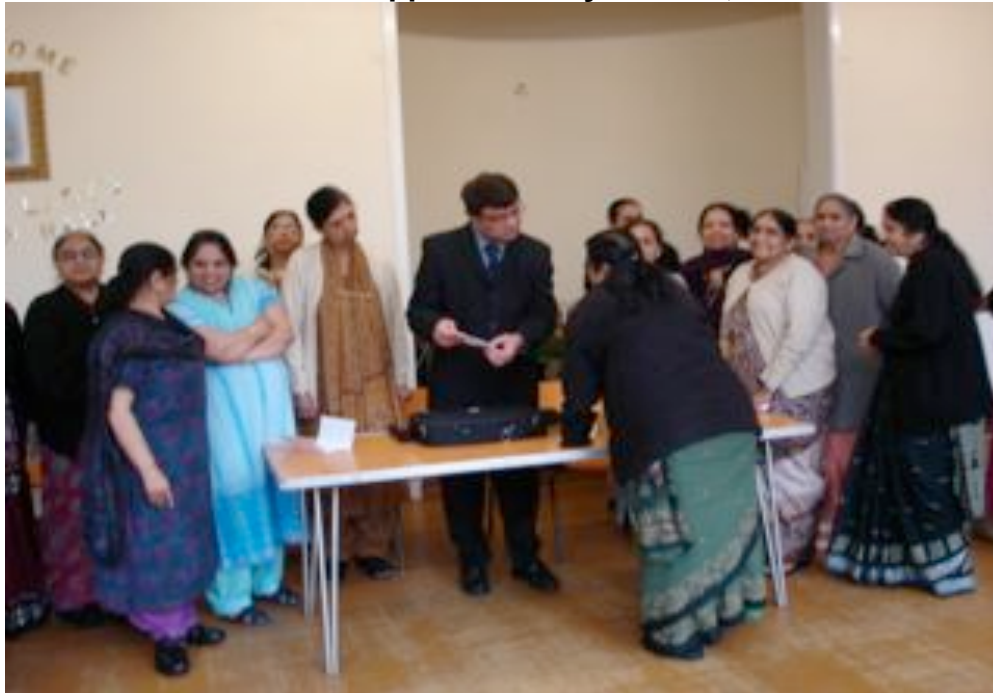
St. Theodore Church—Opp: Soar Vally School,