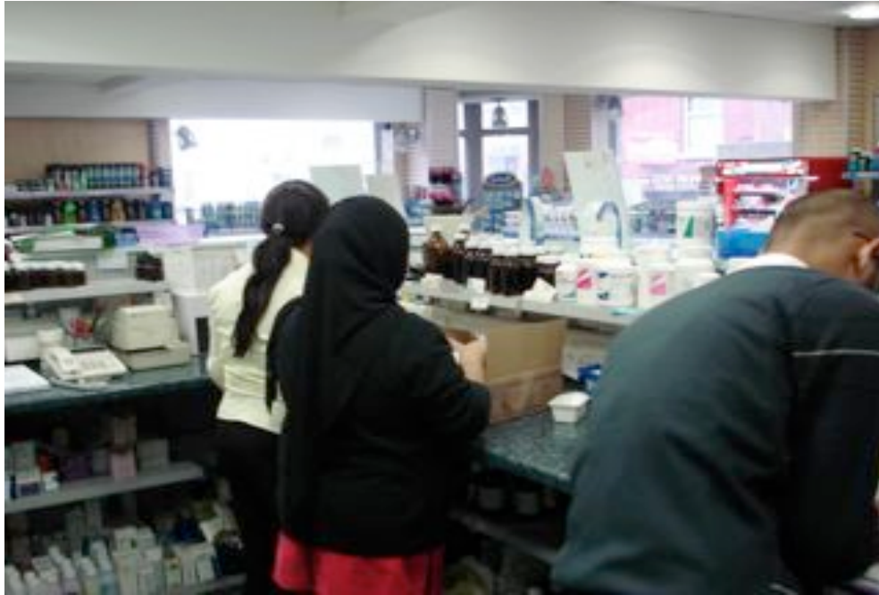
The very busy pharmacy and staff at Yakub Chemist.