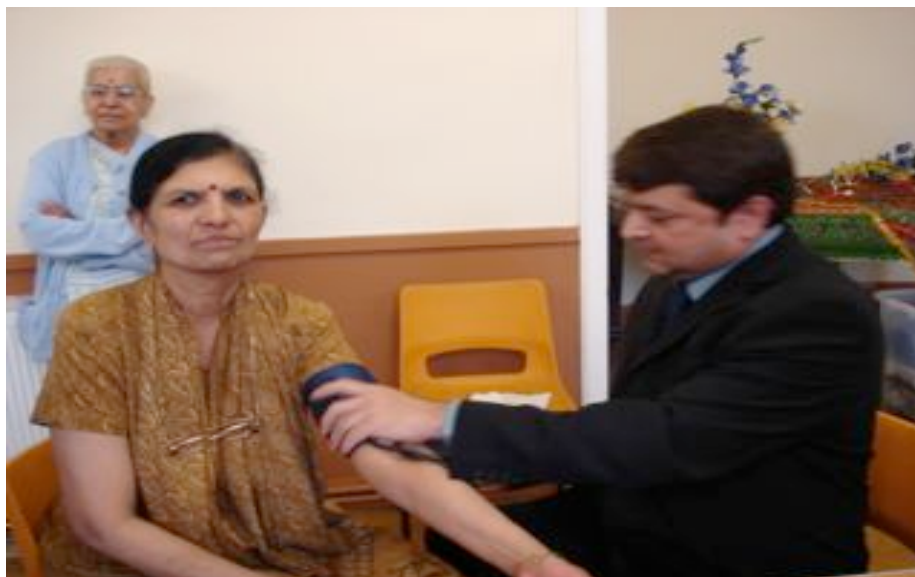
Student Sitting In Clinic 15-04-2009